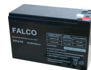
12V DC BATTERY

Model : SF-0523-PT TRANSFORMER 15.0V@3.0A